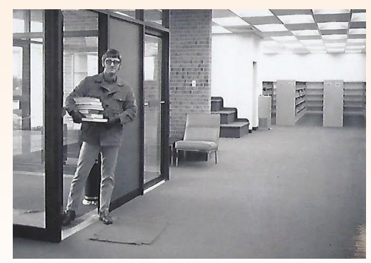
First patron at Central Library, 1971