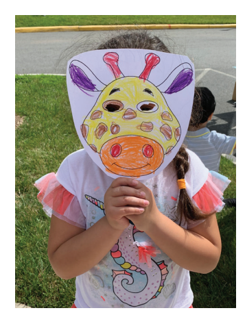
Young patron enjoys outdoor, in-person program

Bringing Back In-Person Programming: Just in time for the start of the Summer Reading Program and more than a year after we suspended in-person programming, Bull Run Library had a Story Walk and tie-dye program and Haymarket Gainesville Library held a Sidewalk Chalk and Mask Making program. Other libraries began introducing inperson programs for all ages.