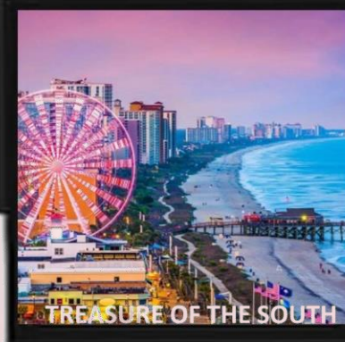
TREASURE OF THE SOUTH