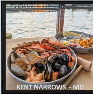
KENT NARROWS - MD