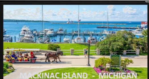
MACKINAC ISLAND - MICHIGAN