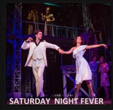
SATURDAY NIGHT FEVER