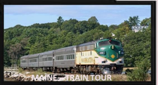
MAINE - TRAIN TOUR