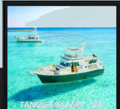
TANGIER ISLAND - VA