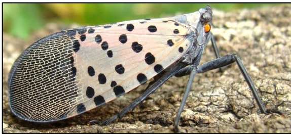
Figure 1. Adult spotted lanternfly.

Spotted lanternfly (SLF; Figs. 1 & 2) was first found in Virginia in 2018. SLF is an invasive species strongly associated with tree-of-heaven, Ailanthus altissima , but it has the potential to be a serious agricultural and nuisance pest in Virginia. Awareness of the SLF life cycle is key to recognizing and managing this pest.