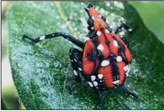
Figure 5. Mature spotted lanternfly nymph (Eric Day, Virginia Tech).