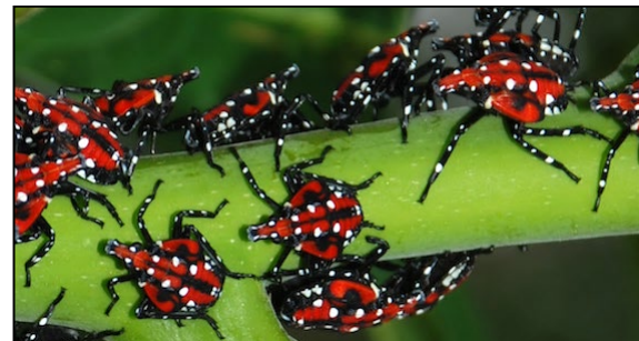
Figure 4. Mature spotted lanternfly nymphs (Eric Day, Virginia Tech).

SLF egg masses measure approximately 25-38 mm (1-1.5") long and 13-19 mm (0.5-0.75") wide. They are usually covered with a grey, waxy coating. Newly laid egg masses are somewhat shiny, but the coating will turn grayish-brown and may crack and fall off with age (Fig. 6). Under the coating are 30-50 brownish seed-like eggs laid end-to-end in 4-7 columns or rows.