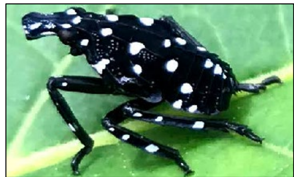
Figure 3. Young spotted lanternfly nymph (Eric Day, Virginia Tech).

the white spots and are also wingless (Figs. 4 & 5). They measure up to 16 mm (0.6") long.