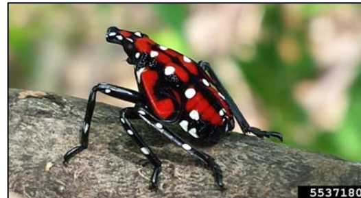
Figure 4. Mature spotted lanternfly nymph.

SLF egg masses are approximately 25-38 mm (1-1.5") long and 13-19 mm (0.5-0.75") wide. They are usually covered with a shiny grey, waxy protective covering when fresh. In time the covering turns a dull grayish-brown and may crack and fall off, exposing the eggs underneath (Fig. 5).