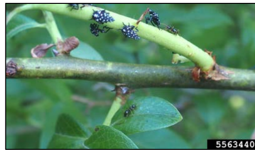
Figure 3. Young spotted lanternfly nymphs.

0.6") are red and black with white spots (Fig. 4). Nymphs are wingless and can jump but not fly.