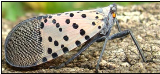
Figure 1. Adult spotted lanternfly (E. Day, Virginia Tech).

Adult SLF measure about 2.54 cm (1") long and 1.3 cm (0.5") wide. The forewings are light colored with black spots and rectangles (Fig. 1). The hindwings are red, black, and white (Fig. 2). At rest, the forewings covering the colorful hindwings (Fig. 1).