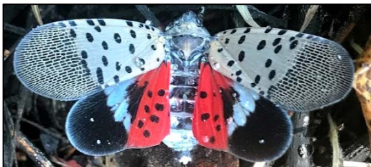
Figure 2. Adult spotted lanternfly with wings spread.

Young SLF nymphs (up to 10 mm or 0.4") are wingless, black, and have white spots on the body and legs (Fig. 3). Mature nymphs (up to 16 mm or