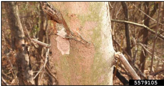
Figure 5. Spotted lanternfly egg mass.

any items that may have egg masses on them as the eggs can hatch in the new location.