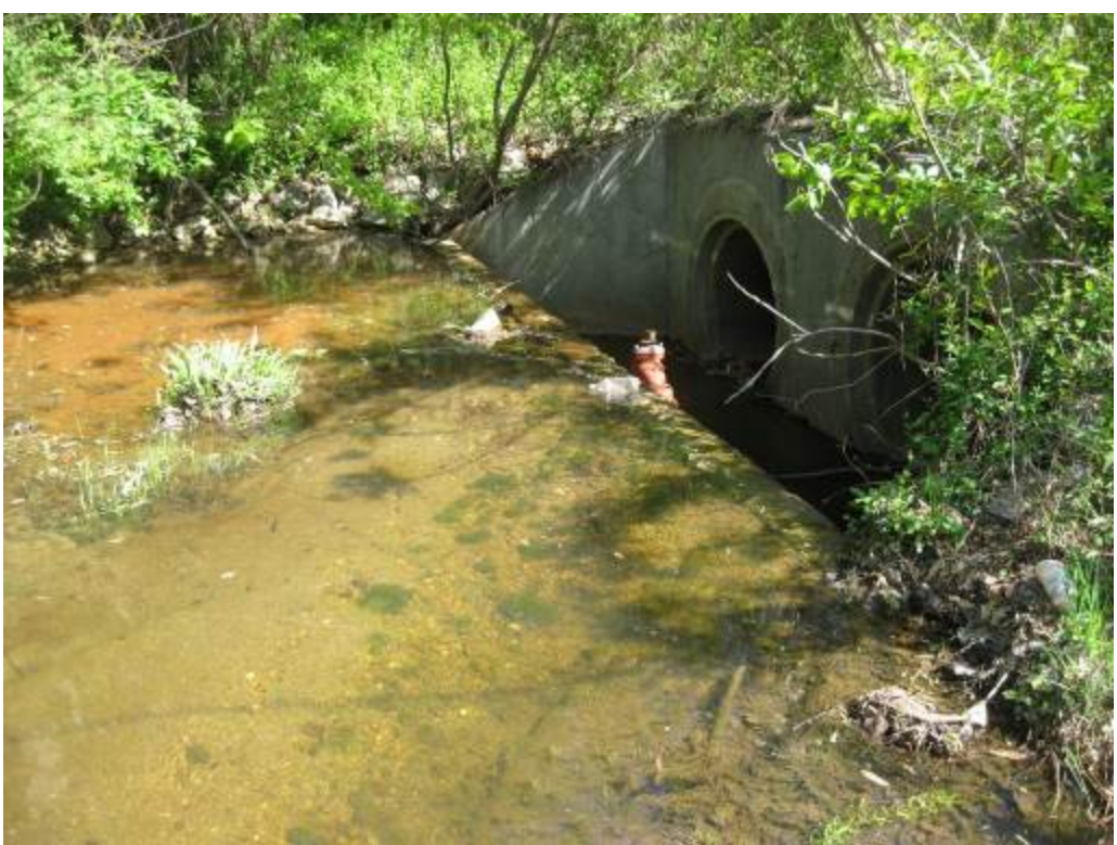
41. Facility 200. Looking downstream at weir wall and double round culverts. Sediment accumulation is evident upstream of facility.