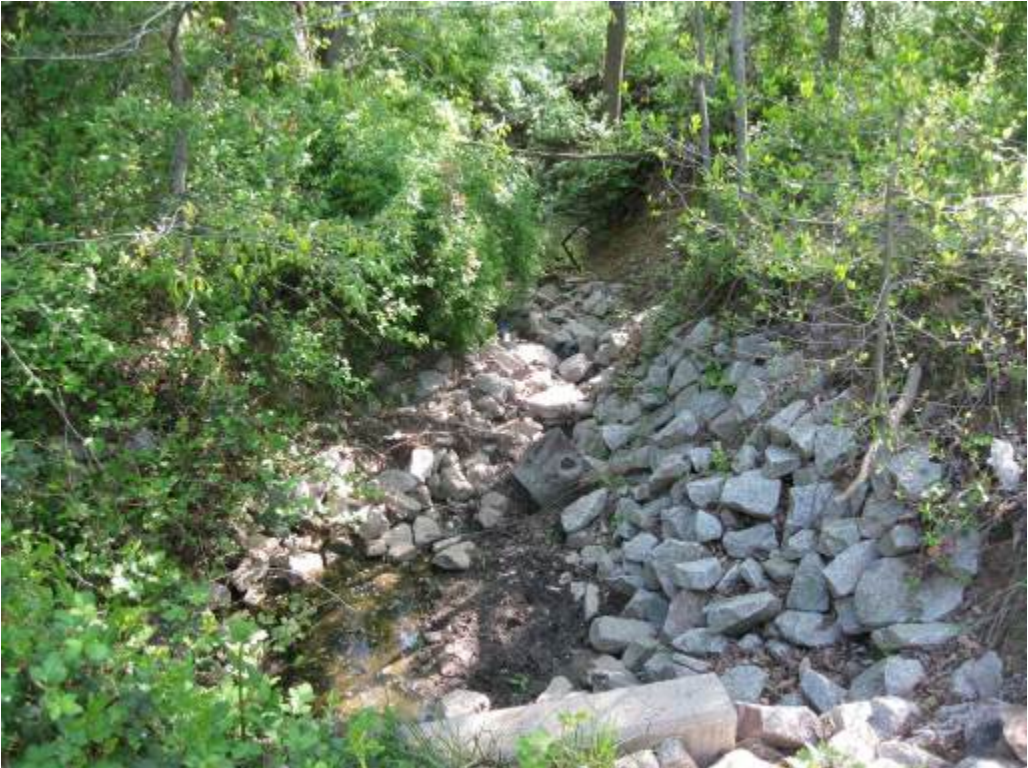
58. Facility 694. Receiving channel immediately downstream of emergency spillway outlet. Channel has been recently stabilized with riprap. Channel is incised with some areas of raw, eroded banks, but appears to be stabilizing beyond immediate area of outlet.