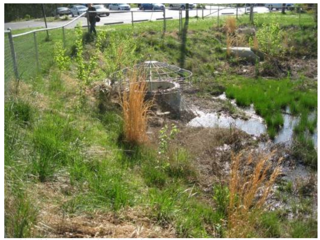
56. Facility 694. Looking at riser with anti-vortex plate and BMP orifice protected by a trash rack. Facility treats church parking lot behind the facility.