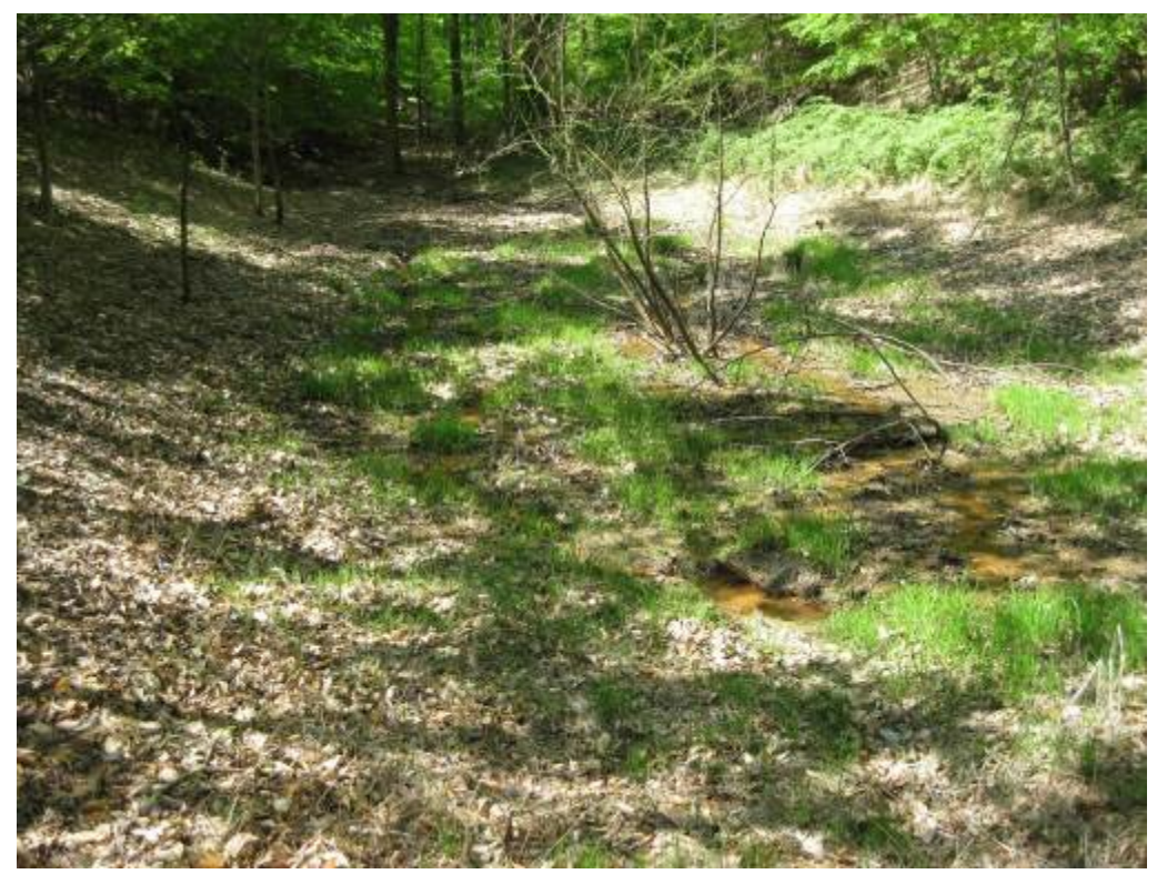
19. Facility 481. Looking upstream at channel flowing through ponding area. Drain tile flush with ground is in foreground (See next photo)