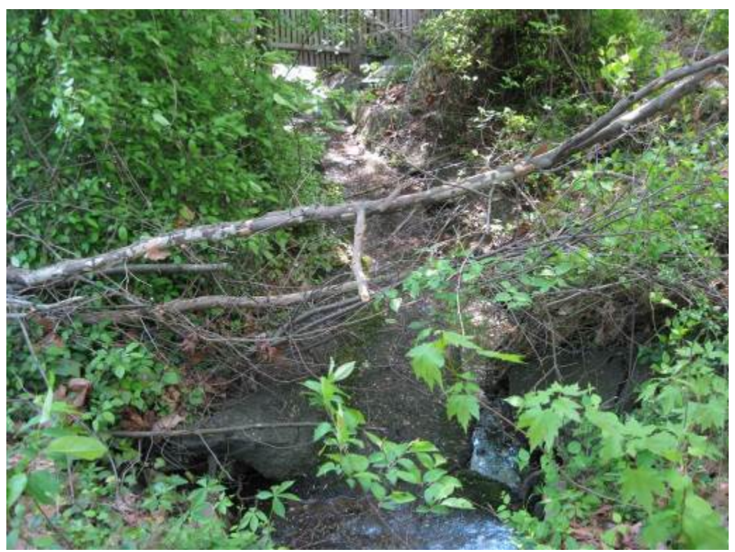
65. Facility 5153. Emergency spillway drains to existing asphalt channel.