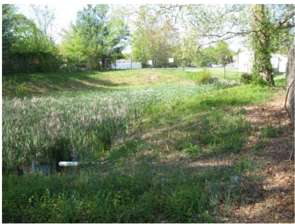
64. Facility 5153. Looking at pond area with dense vegetation. PVC pipe drains near playground.