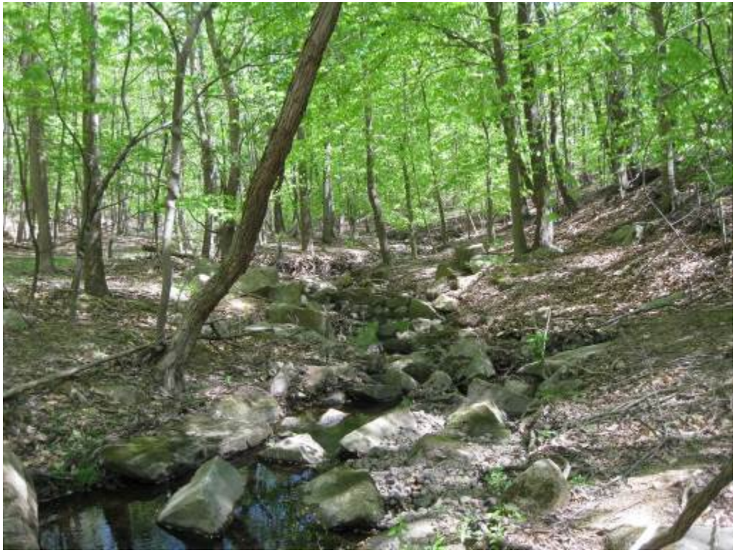
16. Facility 28. Looking at stable receiving channel where facility and emergency spillway drain.