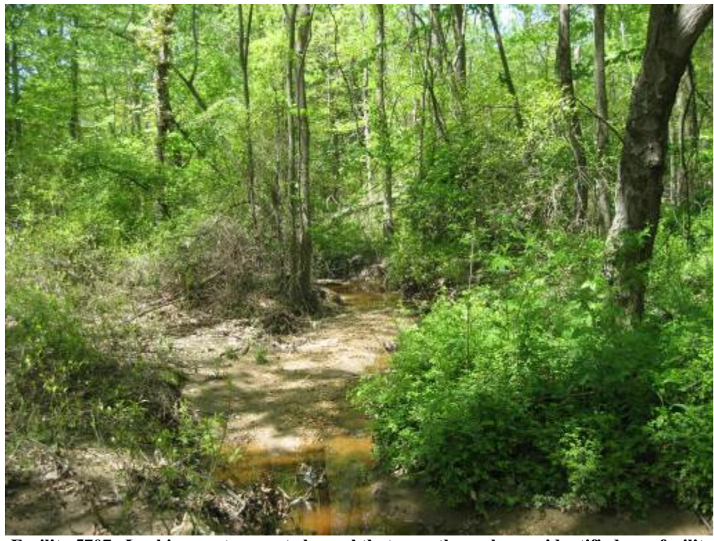
71. Facility 5707. Looking upstream at channel that runs through area identified as a facility. No signs of recent inundation in overbank areas.