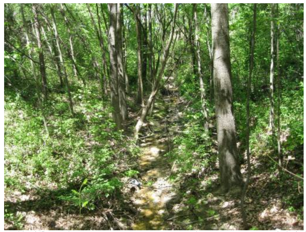
52. Facility 465. Looking upstream at stable channel and adjacent overbank areas within facility.