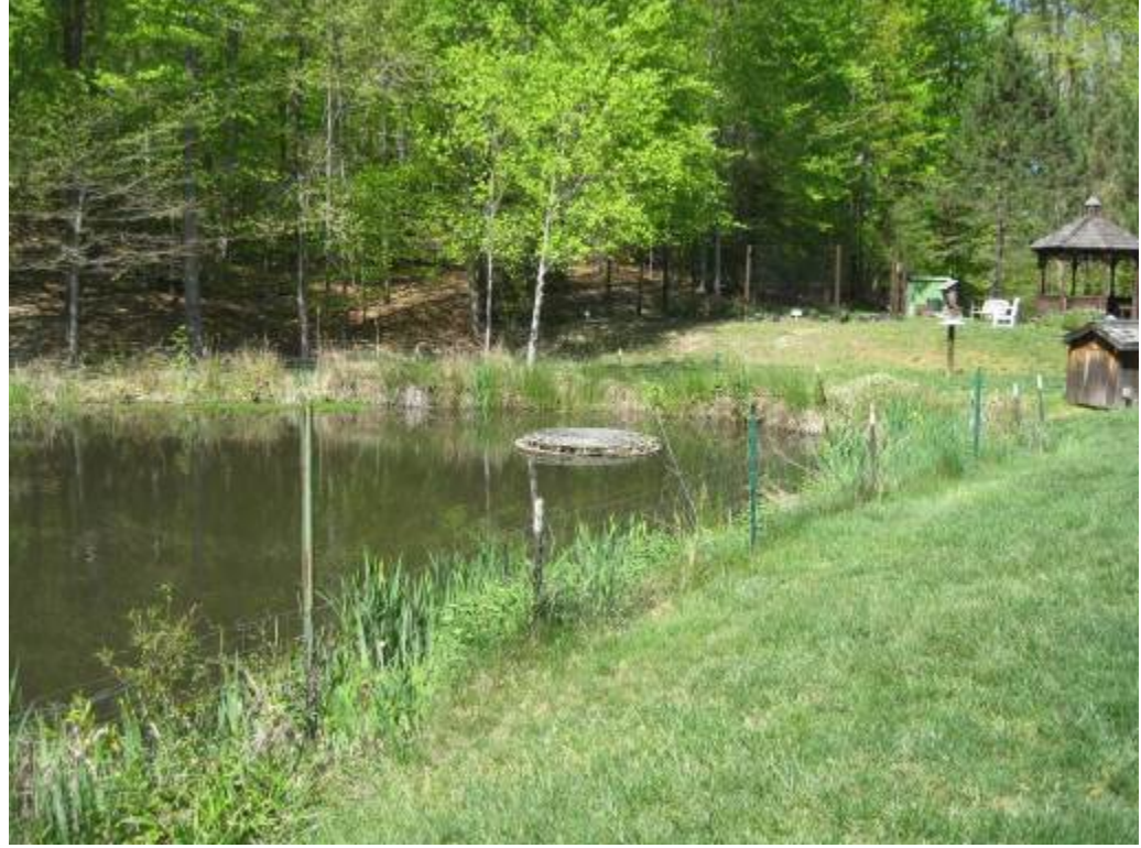
24. Facility 5255. Looking at riser and perimeter fence.