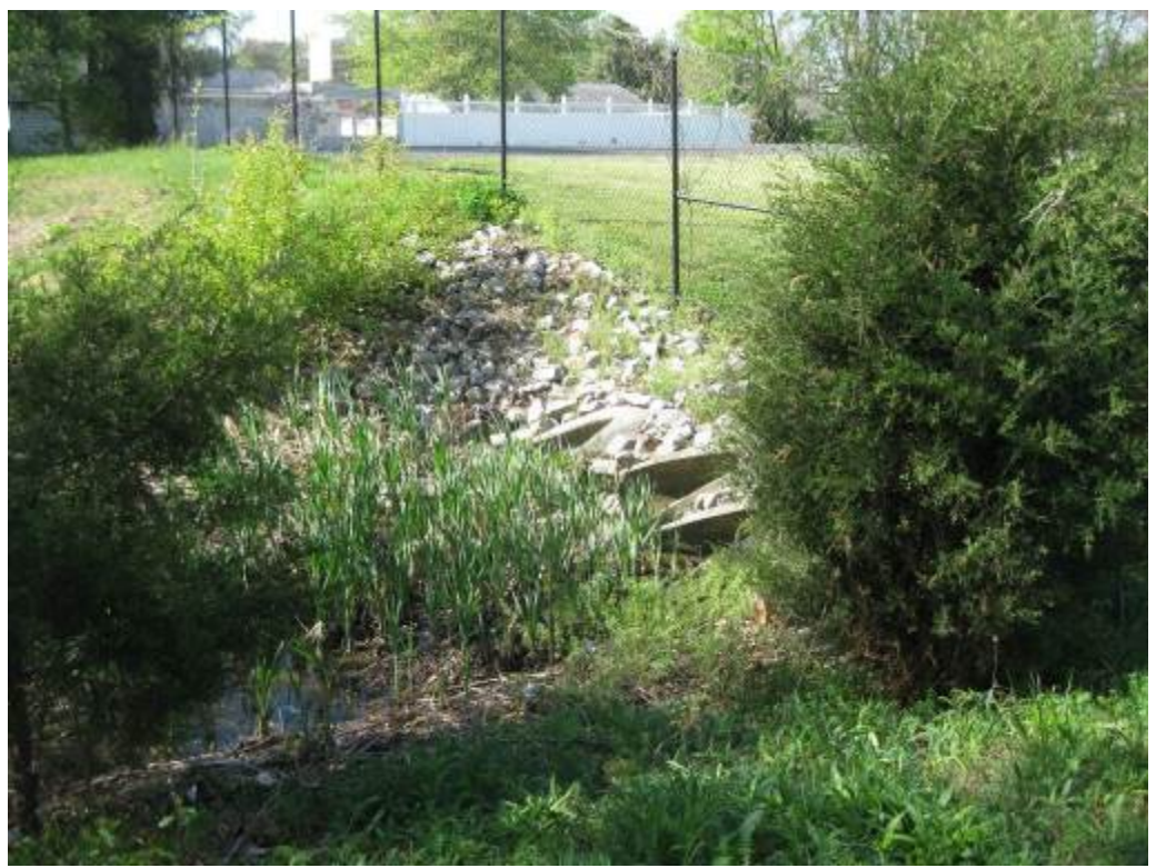
63. Facility 5153. Looking at stable inlet from school buildings.