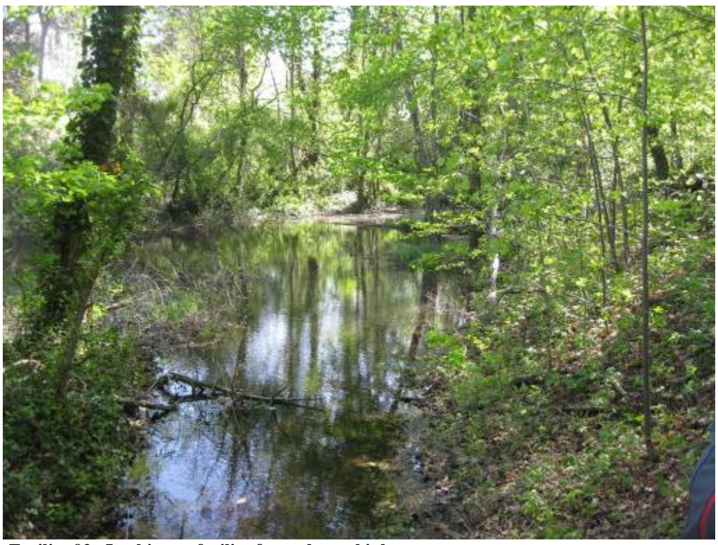
Facility 92. Looking at facility from channel inlet.