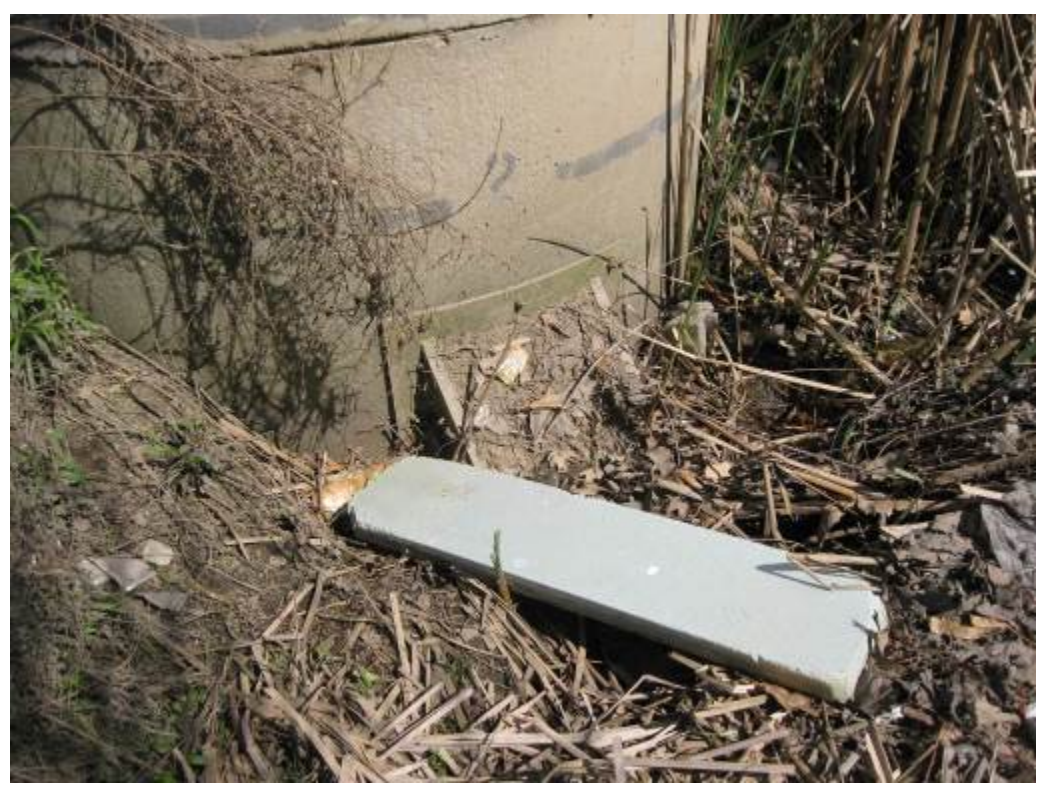
67. Facility 5400. Trash rack on low flow orifice was covered in sediment and debris, but was draining through riser structure.