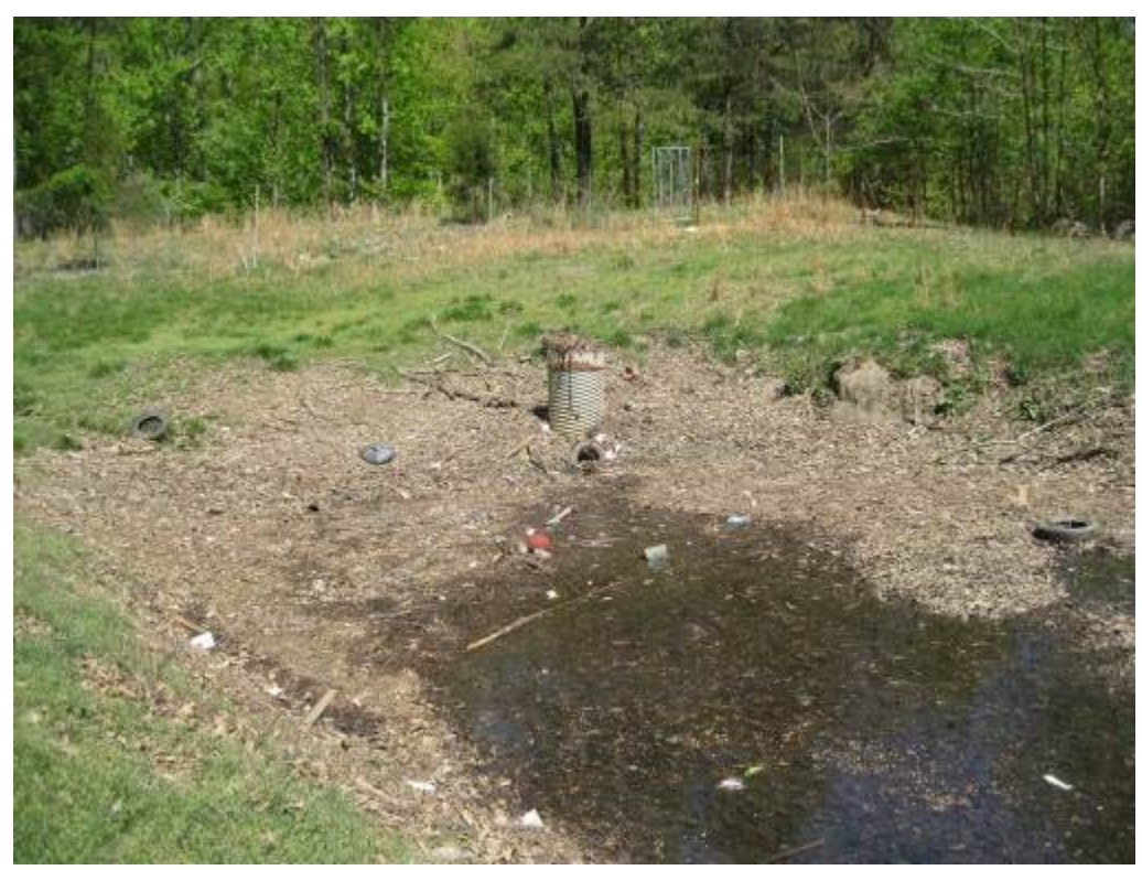
13. Facility 28. Perforated corrugated metal riser was clogged with trash, leaf litter, and other organic material. A foul odor was coming from the riser structure. The emergency spillway and dam are shown in the background.