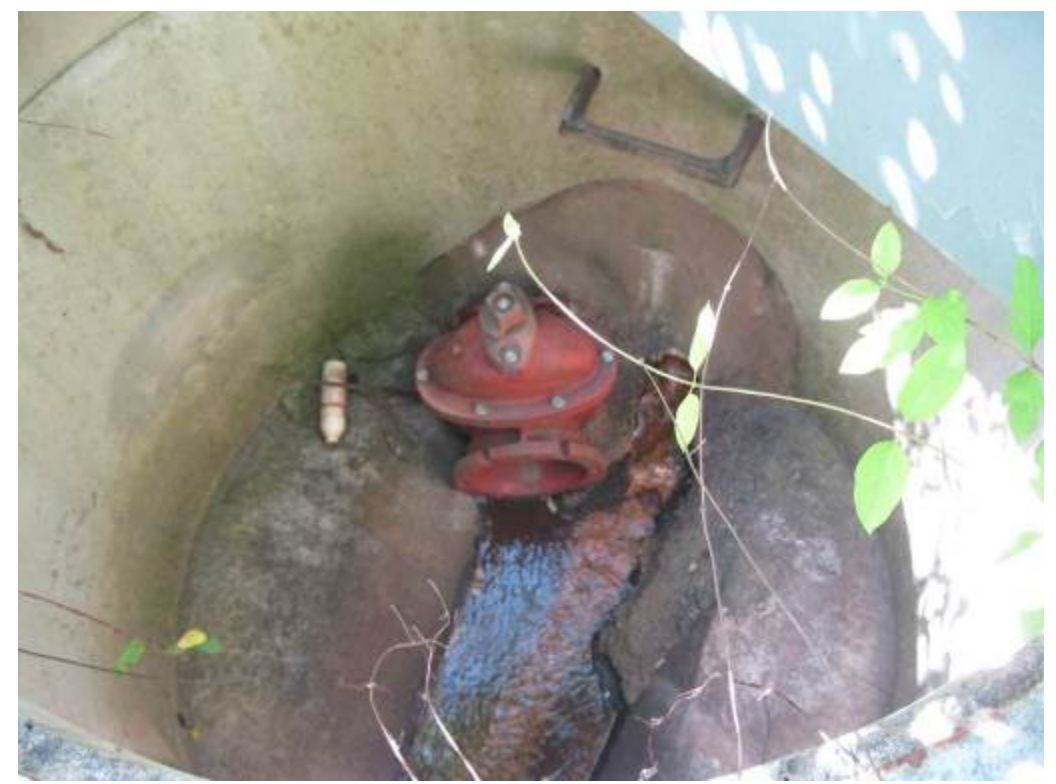
34. Facility 163. Looking in riser at maintenance valve and low flow orifice.