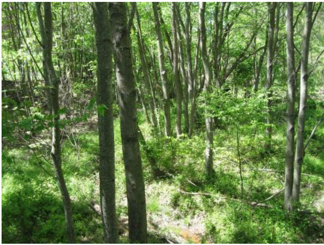
61. Facility 5047. Looking at overbank areas adjacent to the channel that runs through the area identified as the facility.