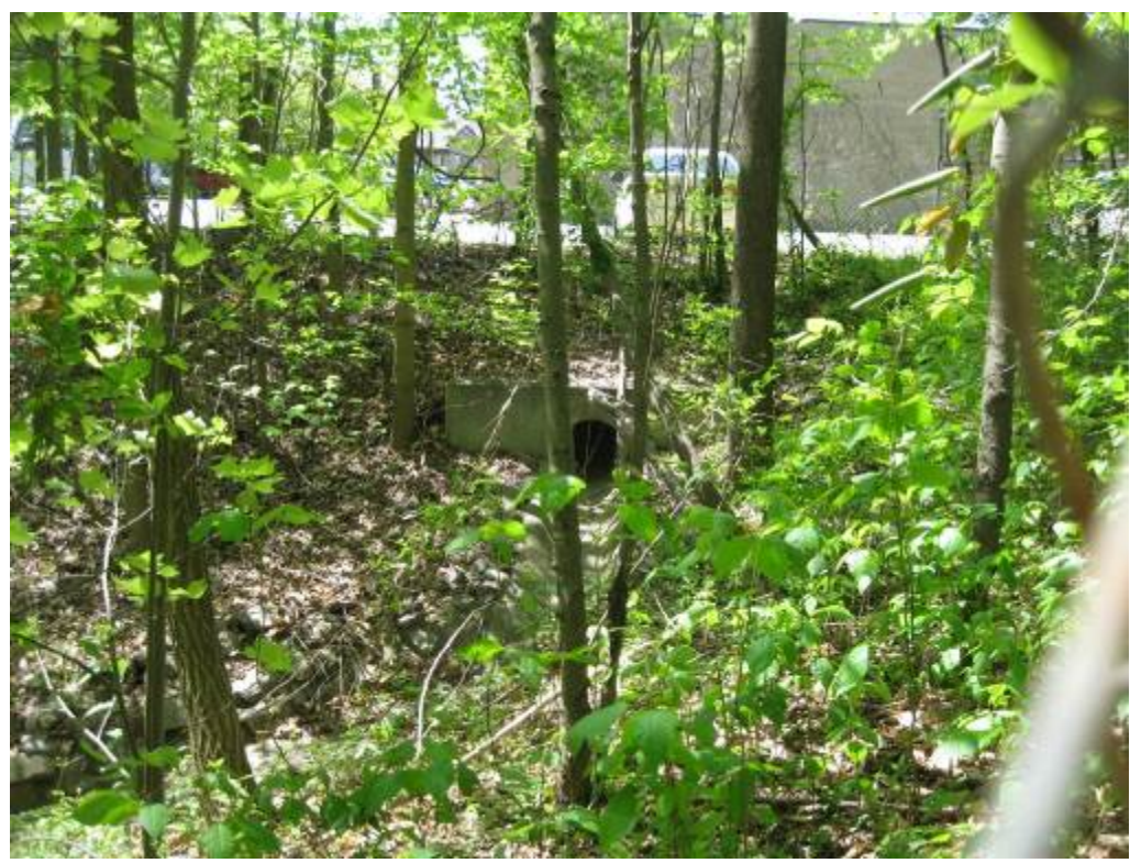
21. Facility 5147. Looking at pipe that drains parking lot runoff into facility.