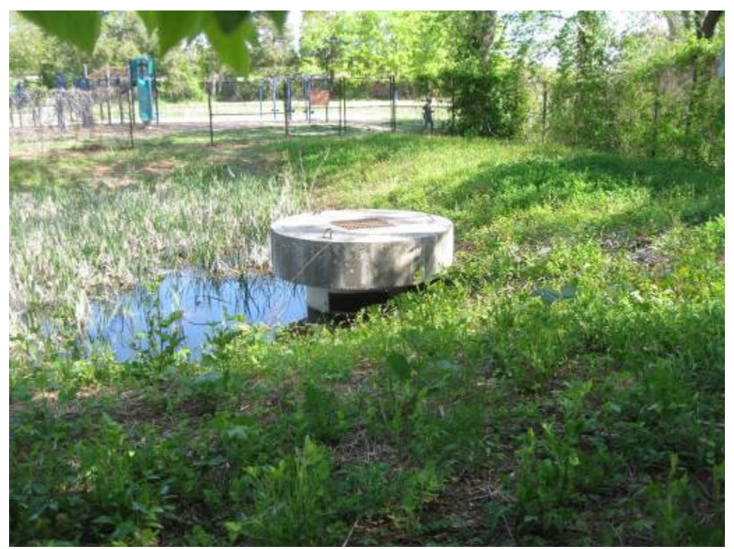
62. Facility 5153. Looking at concrete riser. Facility treats school lot, including buildings, parking lot, playground, and turf grass.