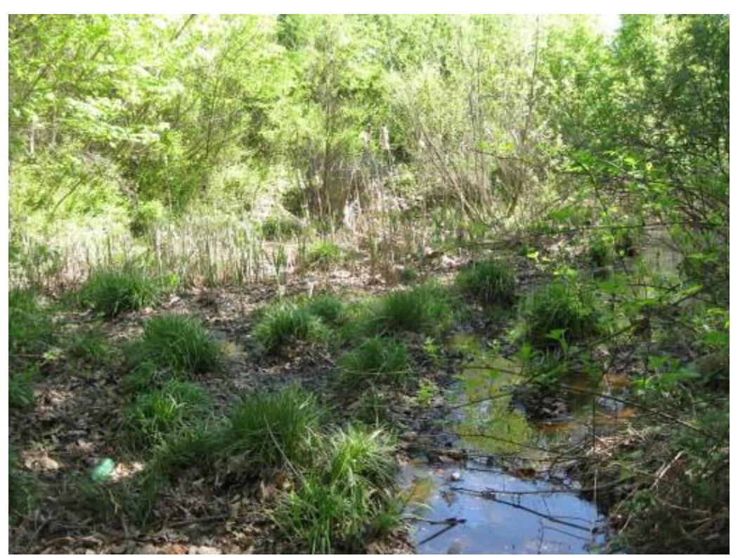
35. Facility 163. Looking at ponding area from riser.