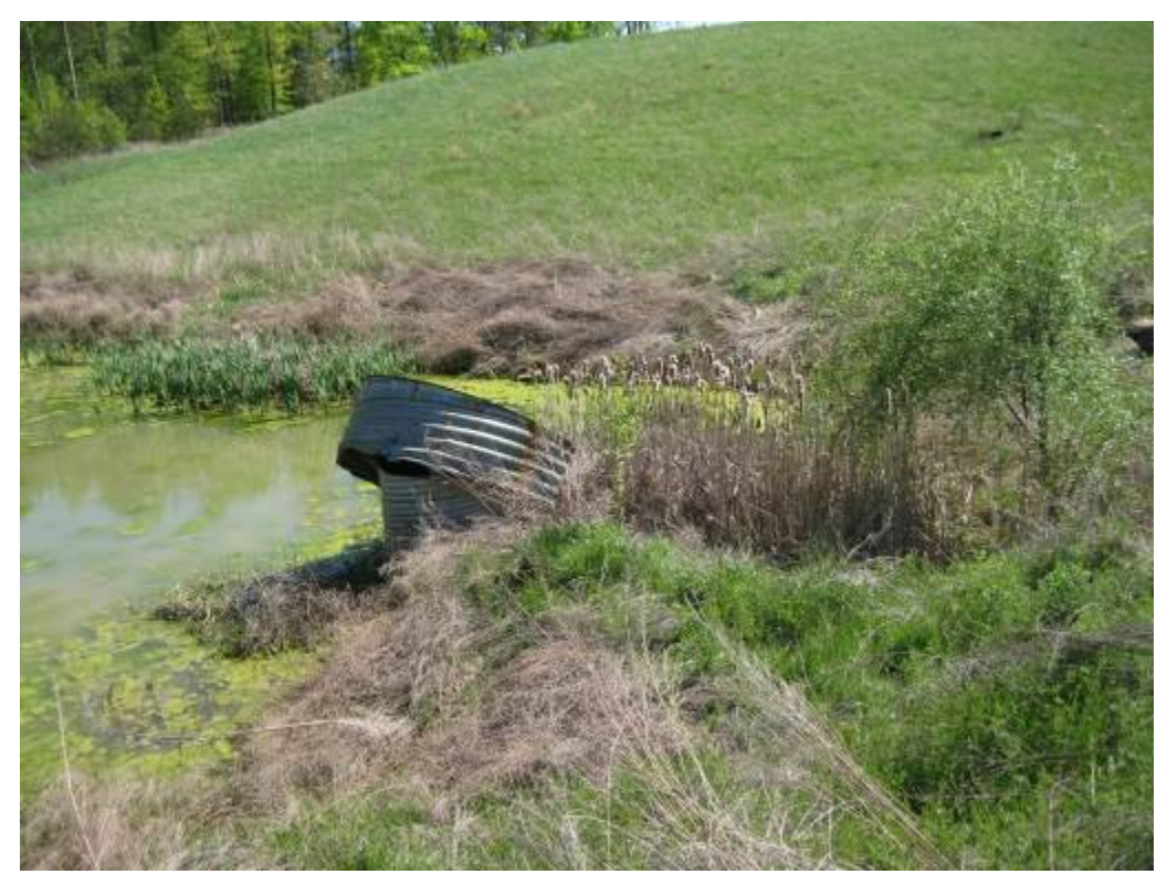
68. Facility 5400. This pond was not identified on the list, but is located immediately upstream of Facility 5400. The top of the riser was bent, and the perforations were sealed (indication facility is operating as a sediment basin).