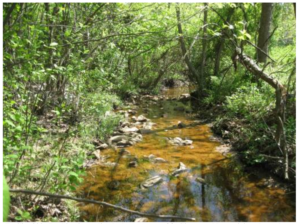
45. Facility 200. Looking immediately downstream of facility at stable receiving channel.