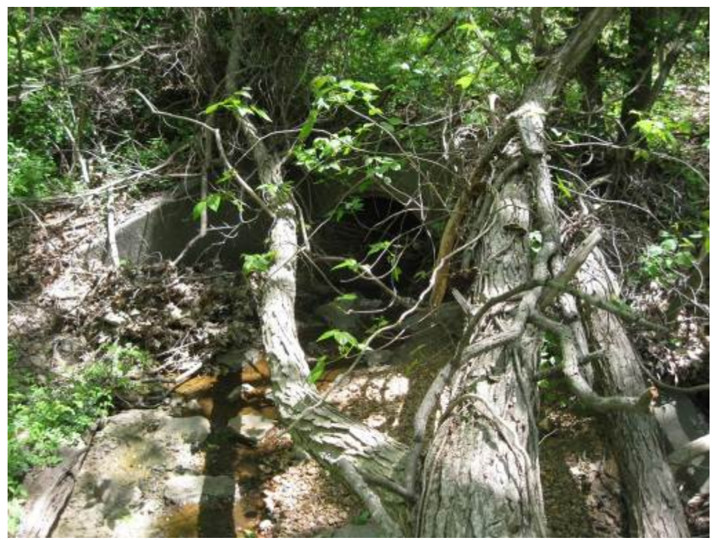
69. Facility 5707. This may not be a facility as there is no riser structure, and the outlet is a large culvert that runs under an existing dirt road.