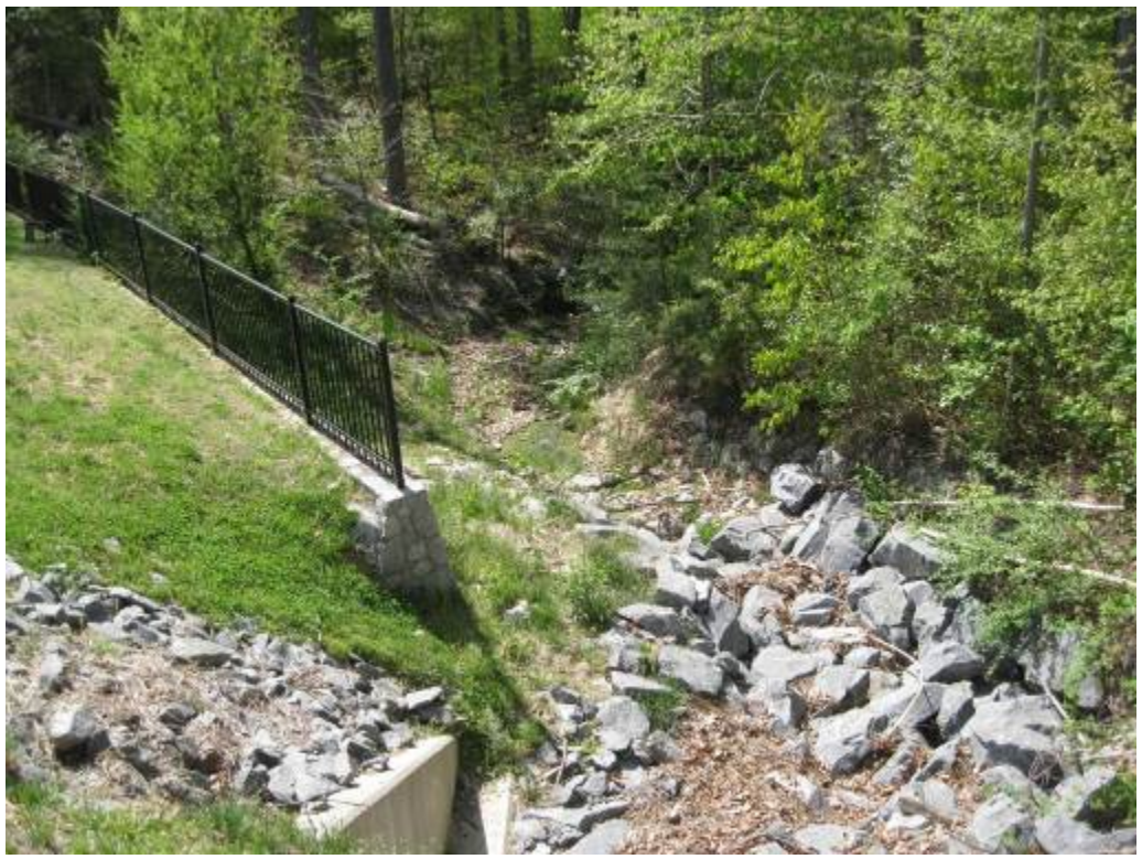
55. Facility 691. Looking at emergency spillway as it ties into stable, existing channel.