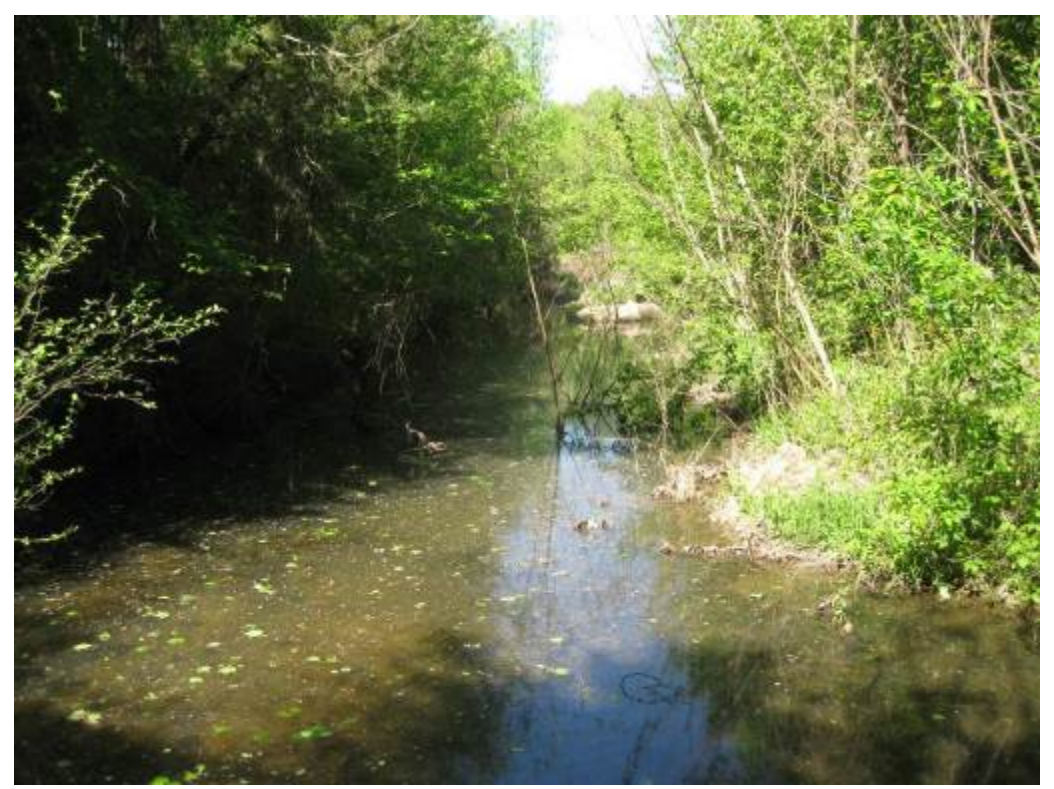
40. Facility 201. Looking upstream at backwater area in existing channel within facility. There were no signs of recent inundation in the overbank areas.

39. Facility 201. Looking at maintenance valve in weir wall currently covered in debris. The low flow orifice is an approximate 2" diameter pipe with the cut in concrete at the bottom corner. Water was draining through the low flow orifice and overtopping weir wall.