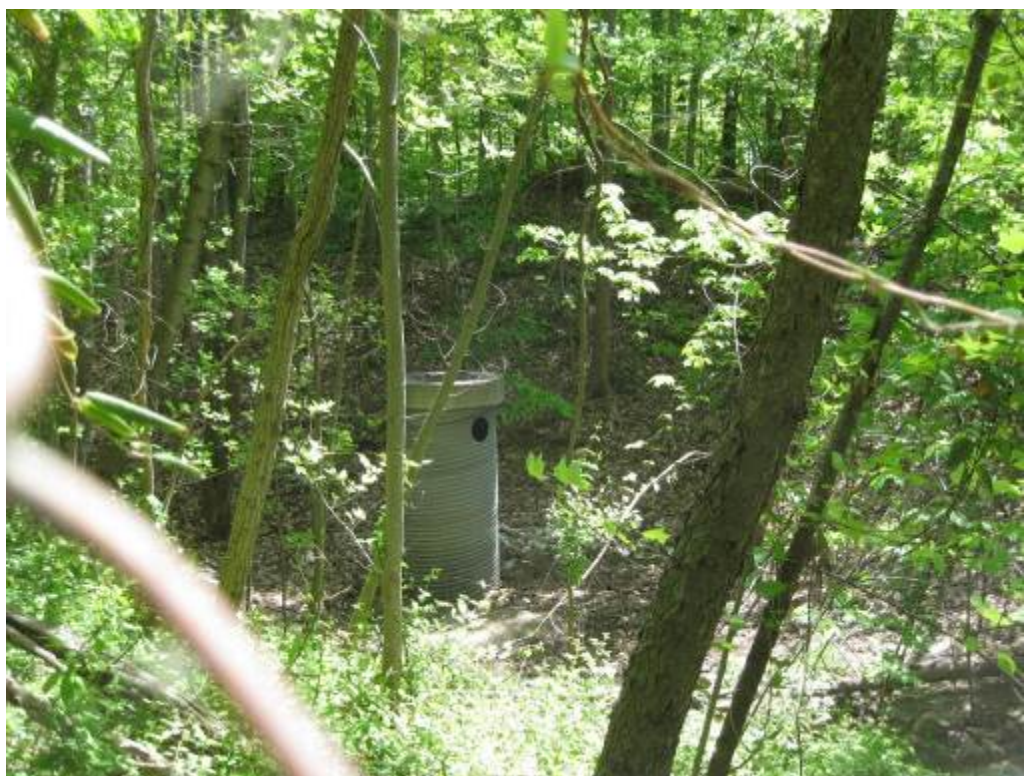
22. Facility 5147. Looking at perforated corrugated metal pipe with flat grate trash rack on top. Concrete trickle ditch runs through bottom of facility and drains into yard inlet at base of riser.