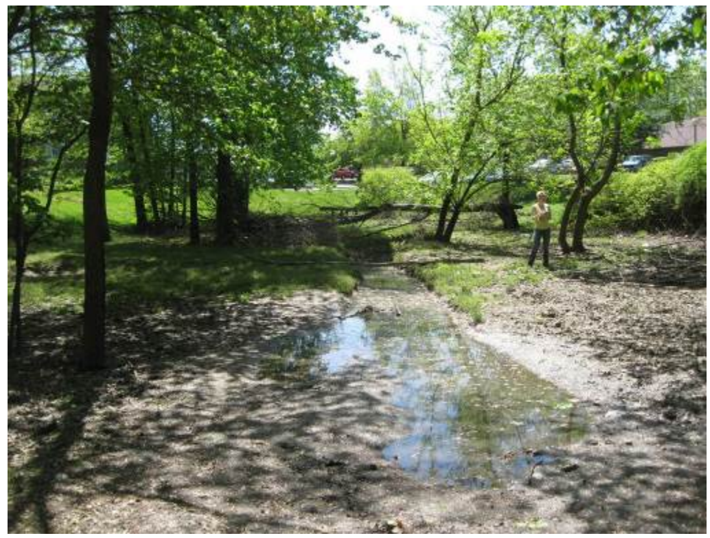
27. Facility 9026. Looking upstream from riser. Water in channel is stagnant with signs of recent inundation in overbank areas. There is no perimeter fence, and there are large trees within the facility.