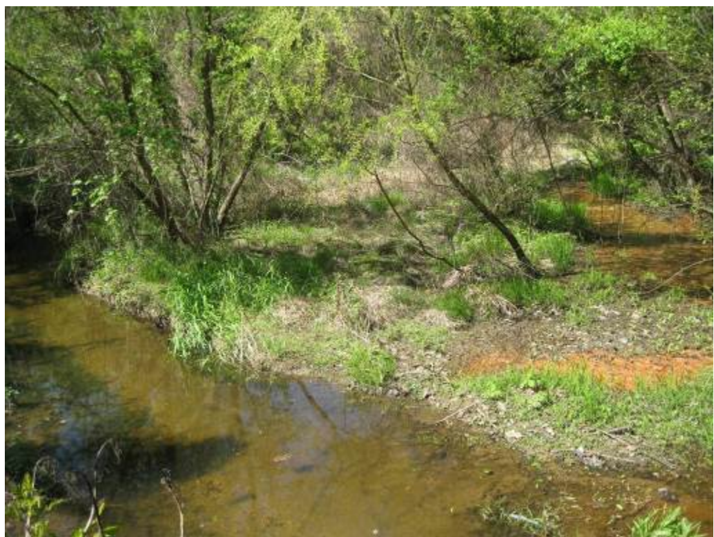
43. Facility 200. Looking at both channels that flow through facility. Sediment has accumulated in overbank areas creating delta shown in photo. The overbank areas which show little sign of recent inundation.