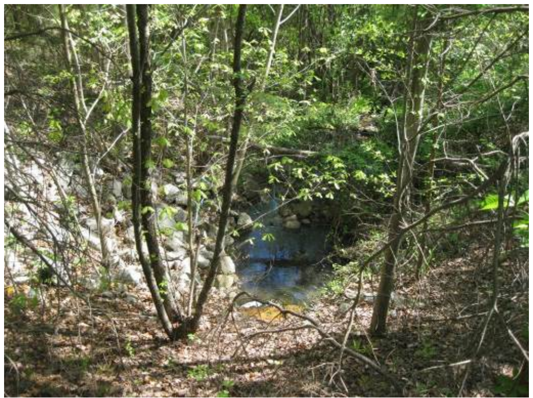
37. Facility 163. Looking at stable receiving channel immediately downstream of facility.