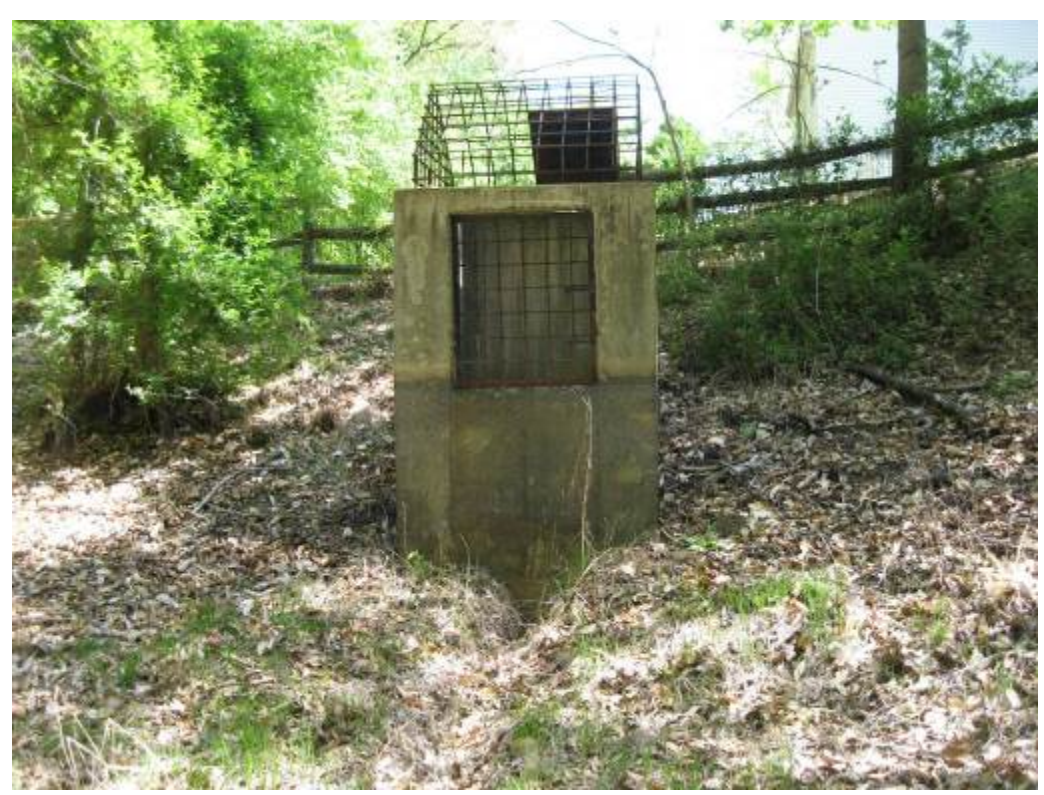
17. Facility 481. Looking at square concrete riser with angled trash rack. Wood perimeter fence is shown background.