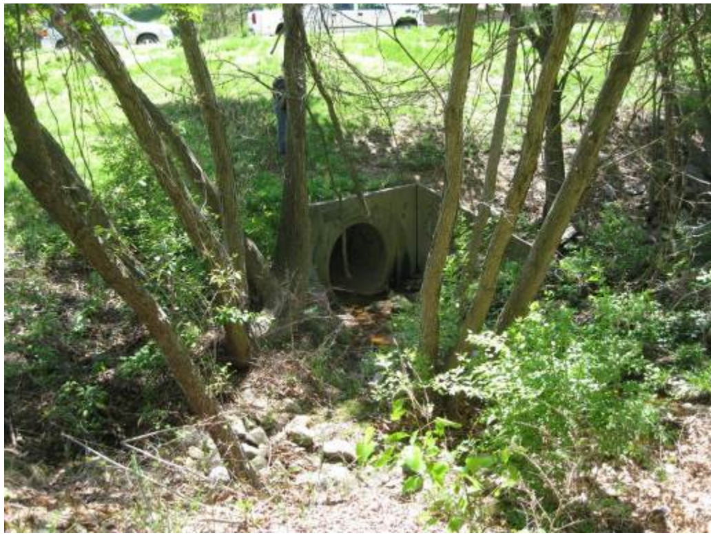
49. Facility 457. This is not a facility. This culvert drains under Rolling Brook Drive into Facility 5047. There are no signs of inundation in the immediate upstream area.