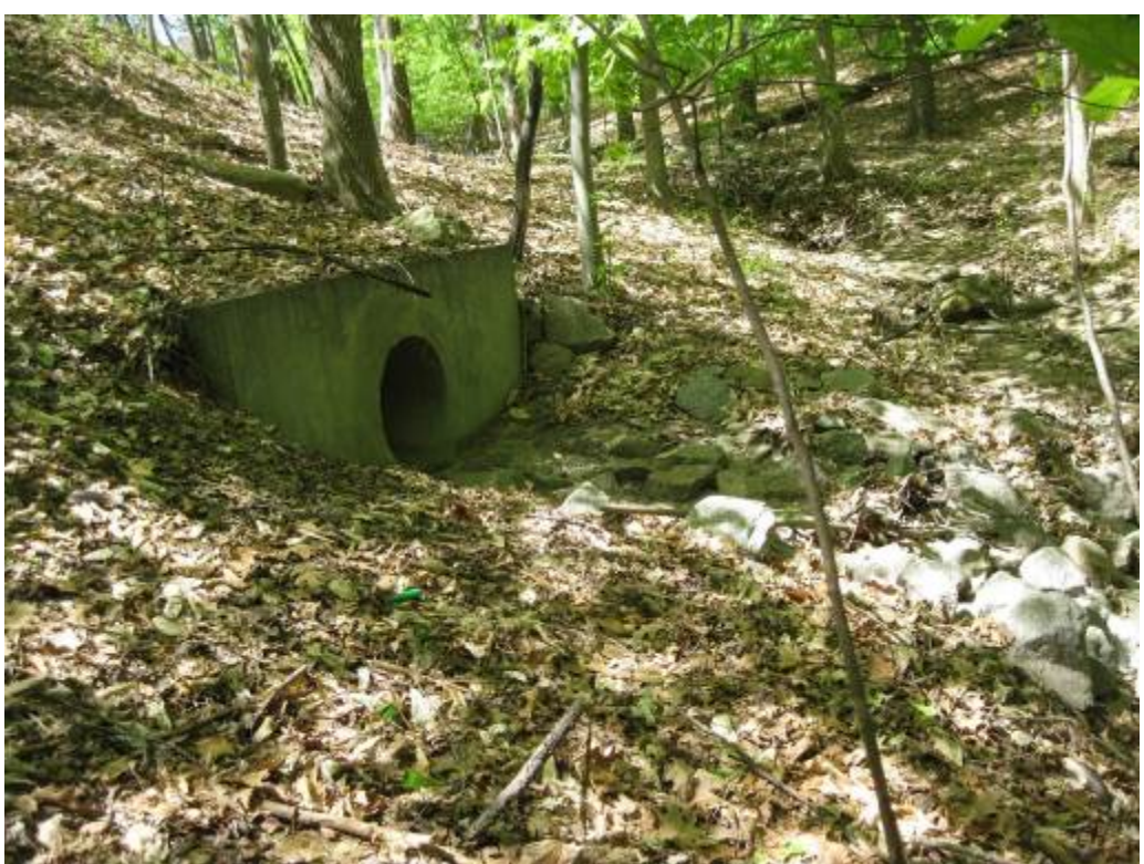
23. Facility 5147. Looking immediately downstream of facility outlet as it drains into receiving channel which is stable.