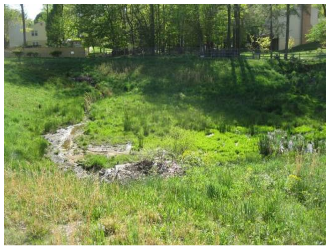
1. Facility 19. Looking upstream at stream and ponding area in facility.