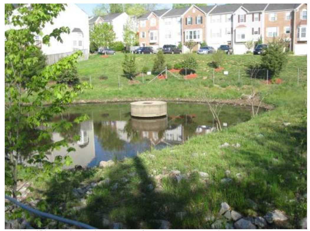
46. Facility 454. Looking at riser structure from the emergency spillway.