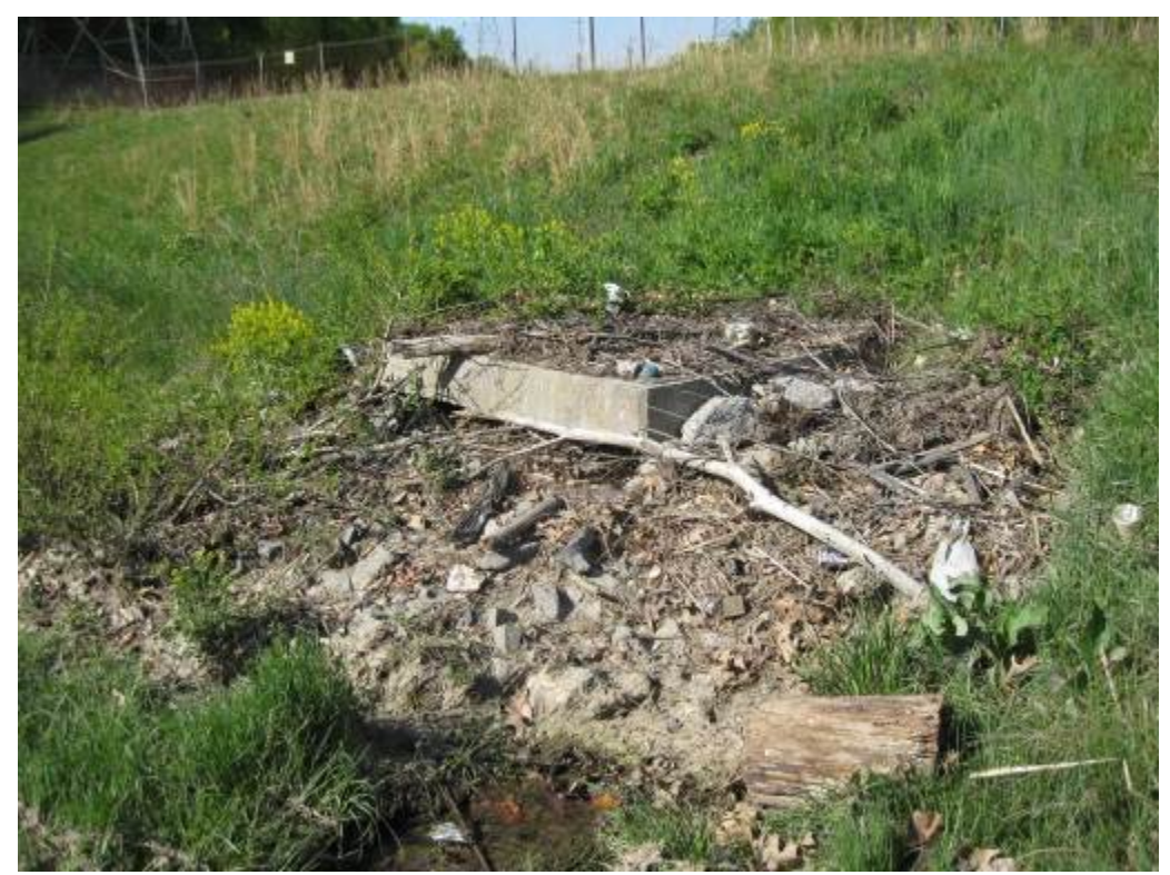
2. Facility 19. Existing riser is clogged with sediment and debris.