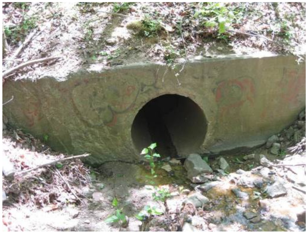
51. Facility 465. Looking at inlet into square concrete riser.