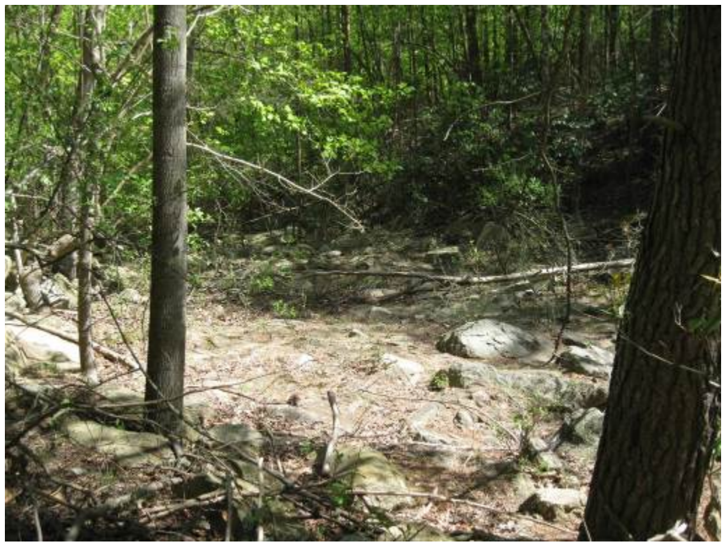
15. Facility 28. Looking at grouted natural boulder in emergency spillway.