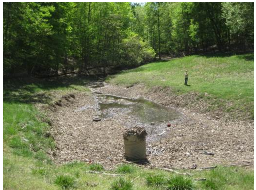
14. Facility 28. Looking at channel and limited ponding area within facility. Bedrock was evident through the facility. There is room for a sediment forebay, but bedrock may restrict excavation.