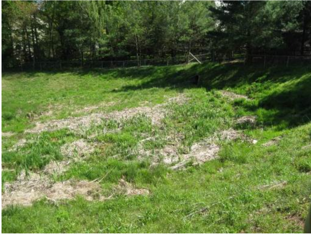
12. Facility. 632. The ponding area was wet.