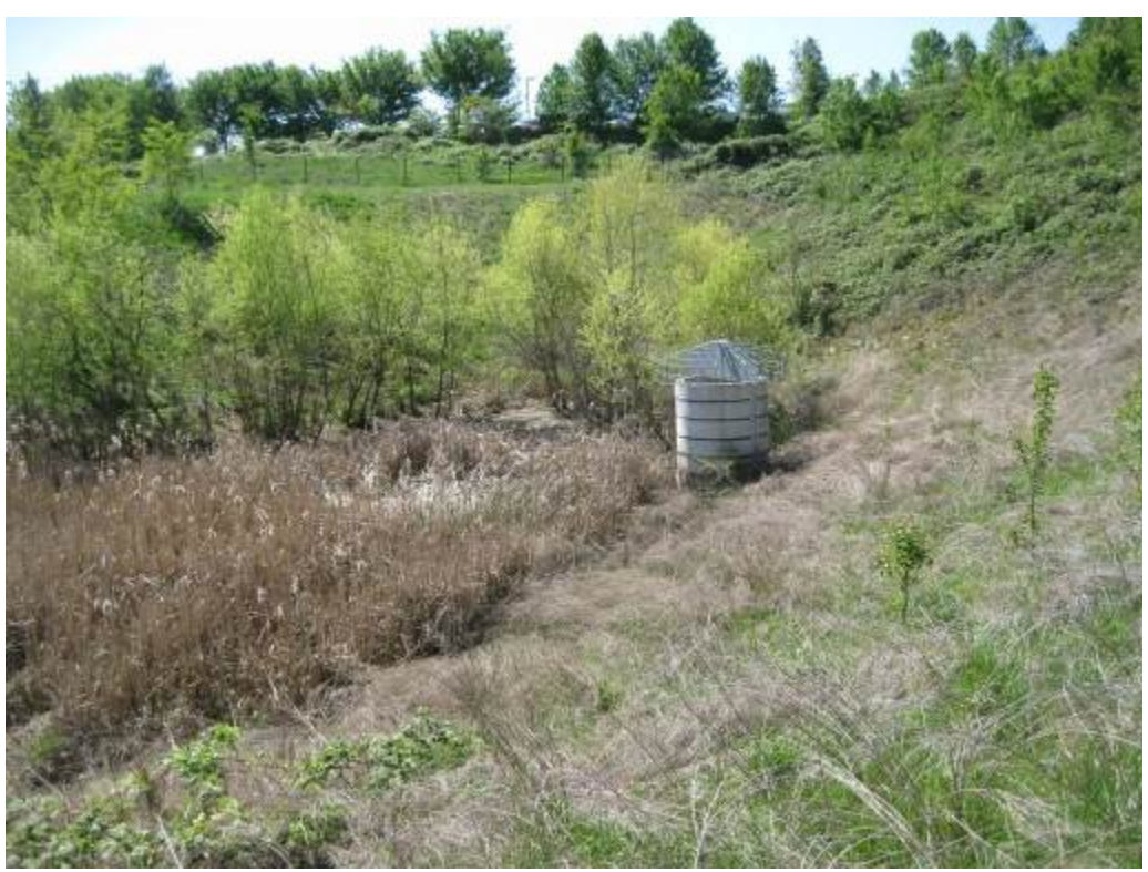
66. Facility. 5400. Looking at riser and wet ponding area.