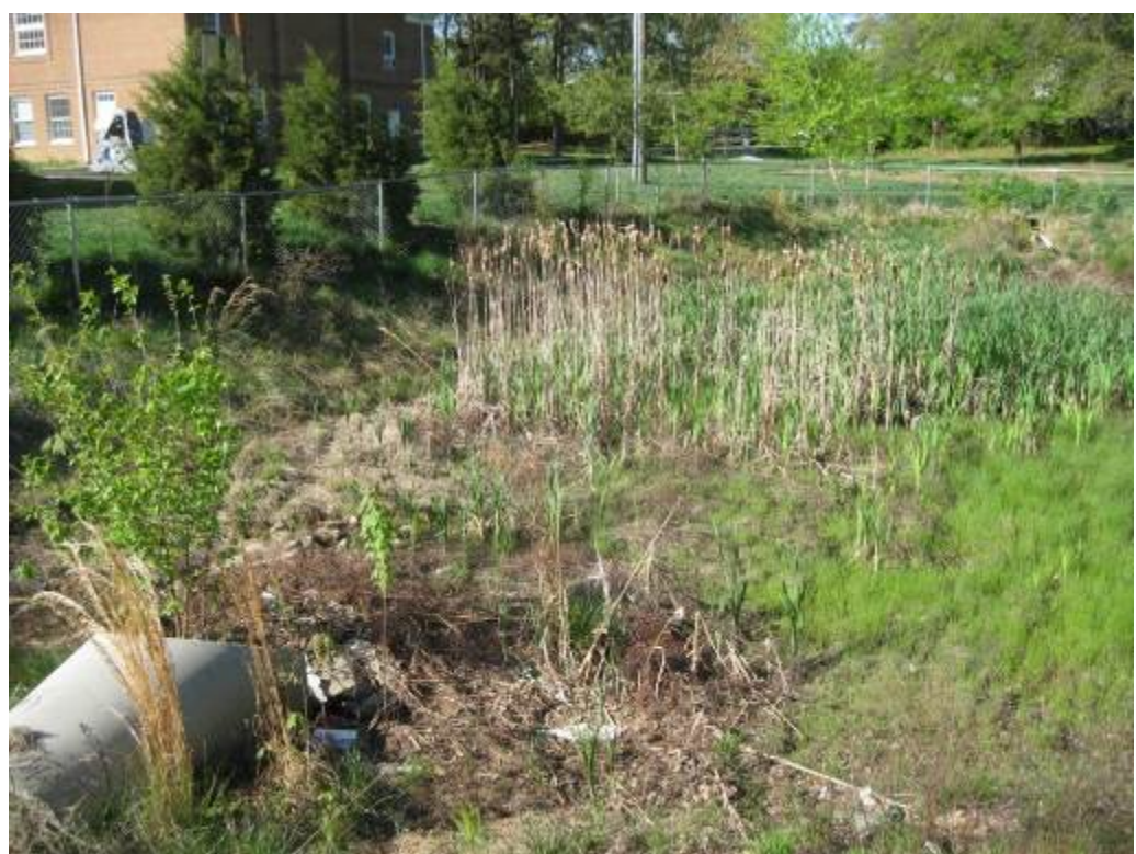
57. Facility 694. Inlets into the facility include the culvert draining from parking lot in foreground and small PVC pipe in background. Ponding area was wet and there were no signs of short-circuiting.