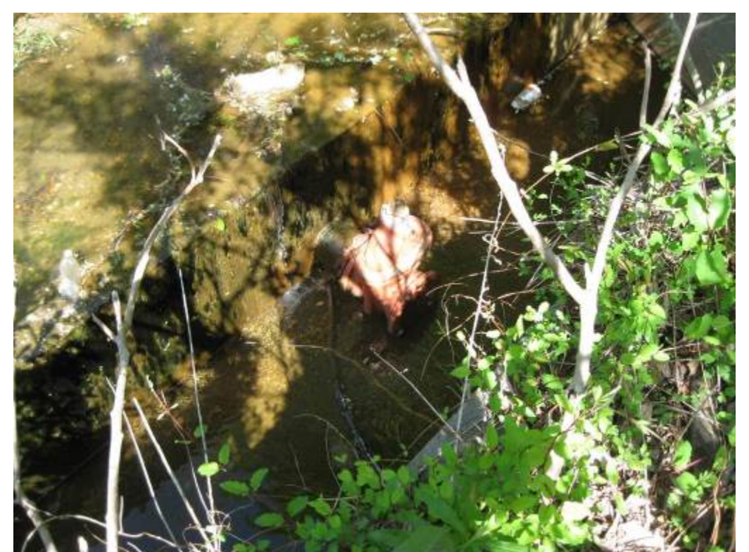
42. Facility 200. Looking at maintenance valve in weir wall. Water was draining over weir wall and through low flow orifice (approx. 2" diameter pipe through wall).