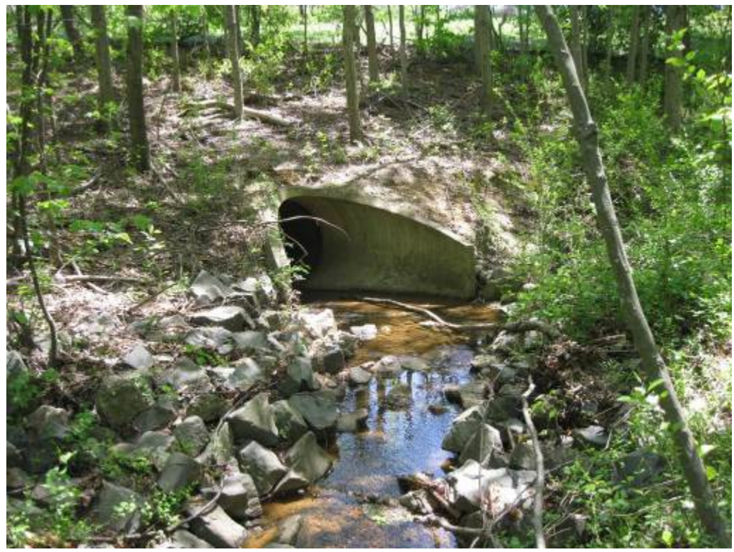
59. Facility 5047. This may not be a facility. There is no riser structure and there were no signs of inundation in area identified as facility.