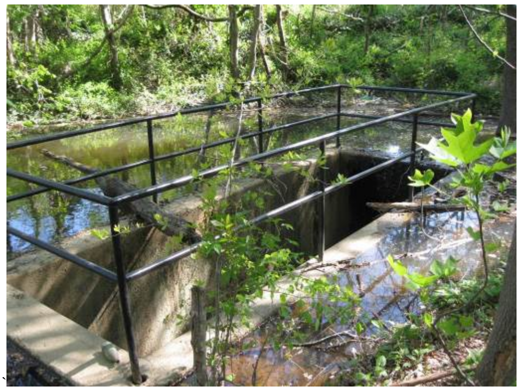
31. Facility 92. Looking at weir outlet structure. Water was overtopping weir.