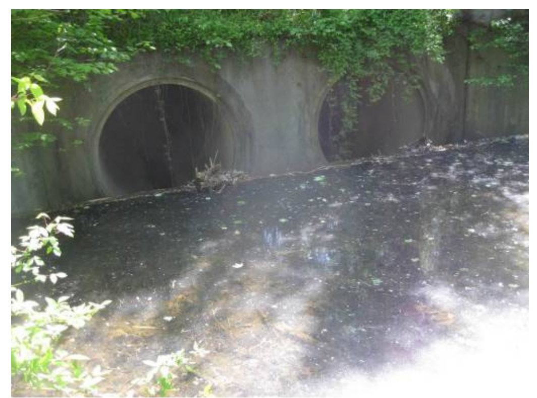
38. Facility 201. Weir wall upstream of two large concrete pipes under Abner Avenue. Sediment accumulation is evident upstream of facility.