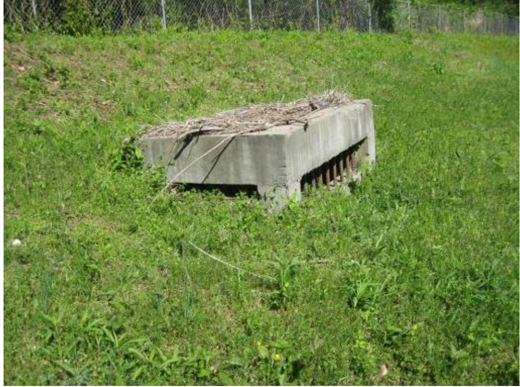
Facility 632. Looking at riser with debris on top of flat grated trash rack.

9. Facility 63. Trash rack covering low flow orifice at base of riser was covered with sediment and debris, but orifice was still draining as shown.