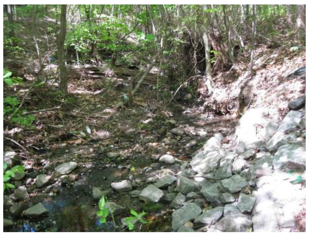
36. Facility 163. Looking at upstream channel. The channel shows some incision and bank instability.