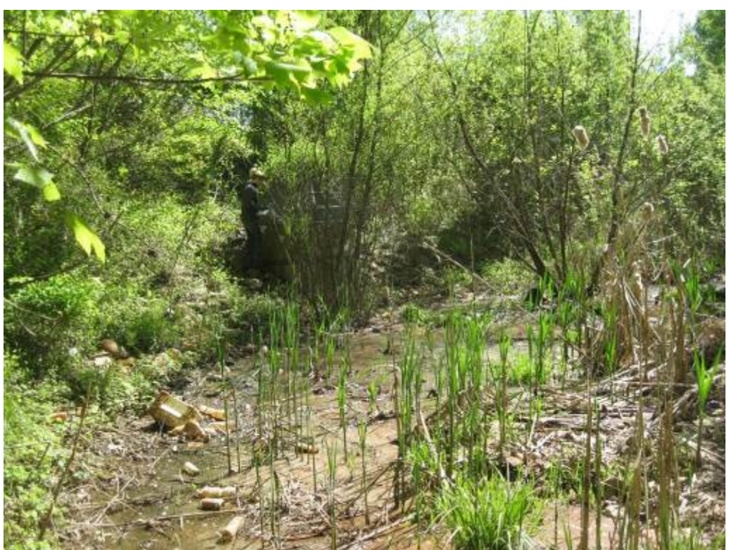
33. Facility 163. Looking at riser and ponding area. Ponding area is full of litter and fine sediment.