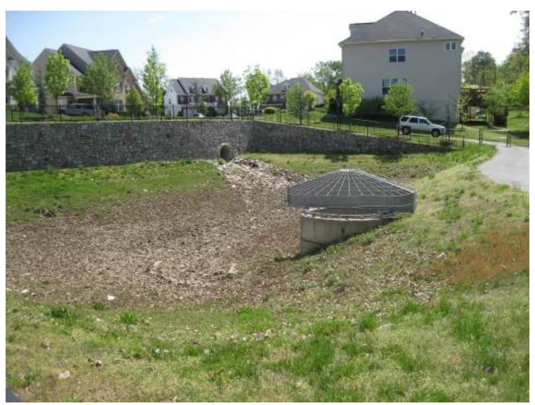
54. Facility 691. Looking at riser with anti-vortex plate and BMP orifice with extended trash rack.