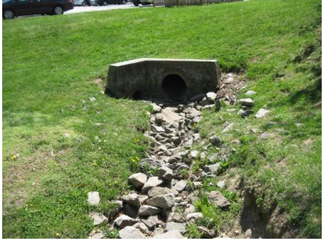
Facility 9026. Looking at inlet that drains parking lot runoff into facility.