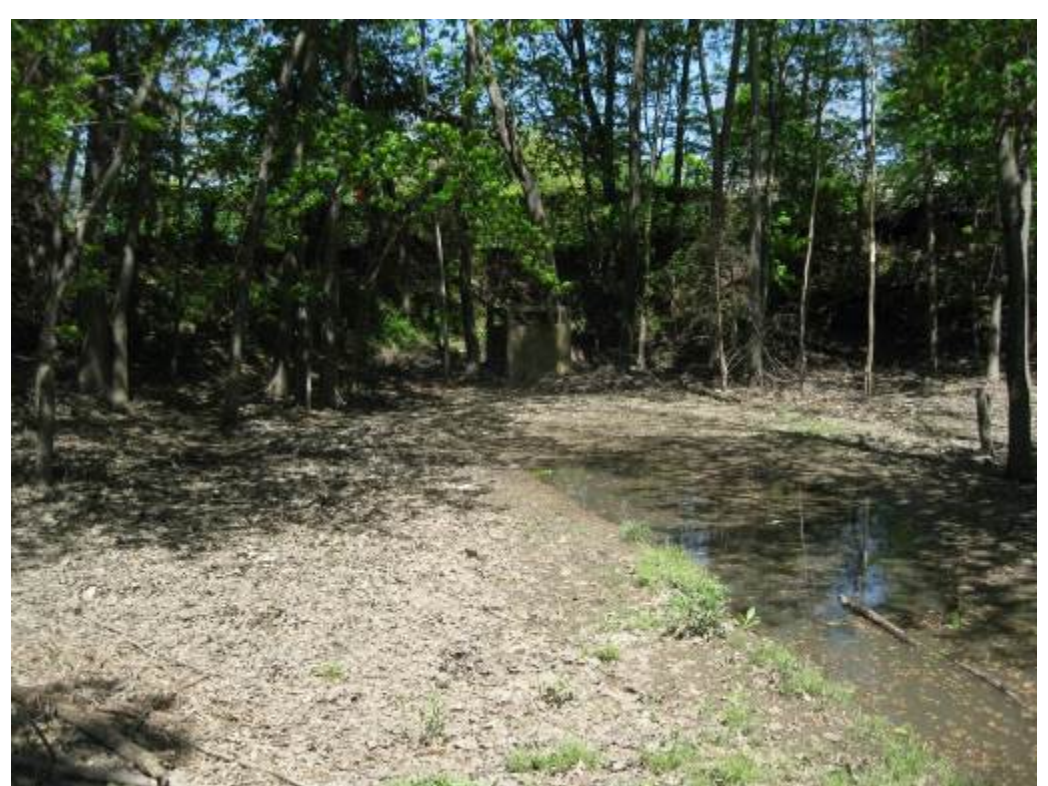
26. Facility 9026. Looking at riser in background with stagnant water in upstream channel and ponding area.