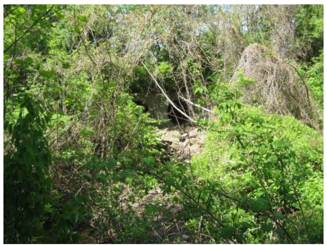
44. Facility 200. Double culverts under Abner Avenue that drain directly from Facility 201.