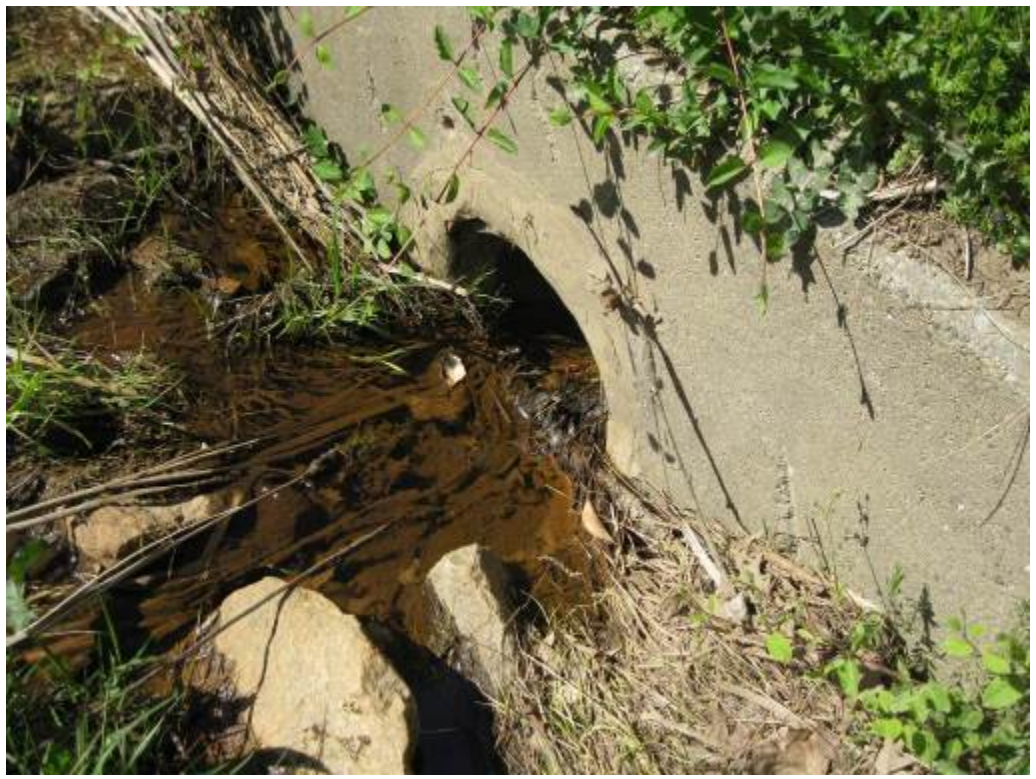
11. Facility 632. Looking at low flow orifice. Holes in headwall indicate a BMP plate or other protective plate was likely removed.