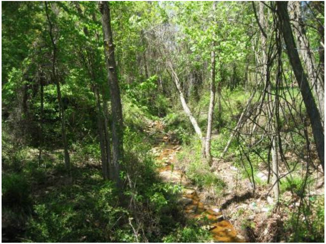
50. Facility 457. Stable channel upstream of culvert under Rolling Brook Drive. No signs of inundation in overbank area.