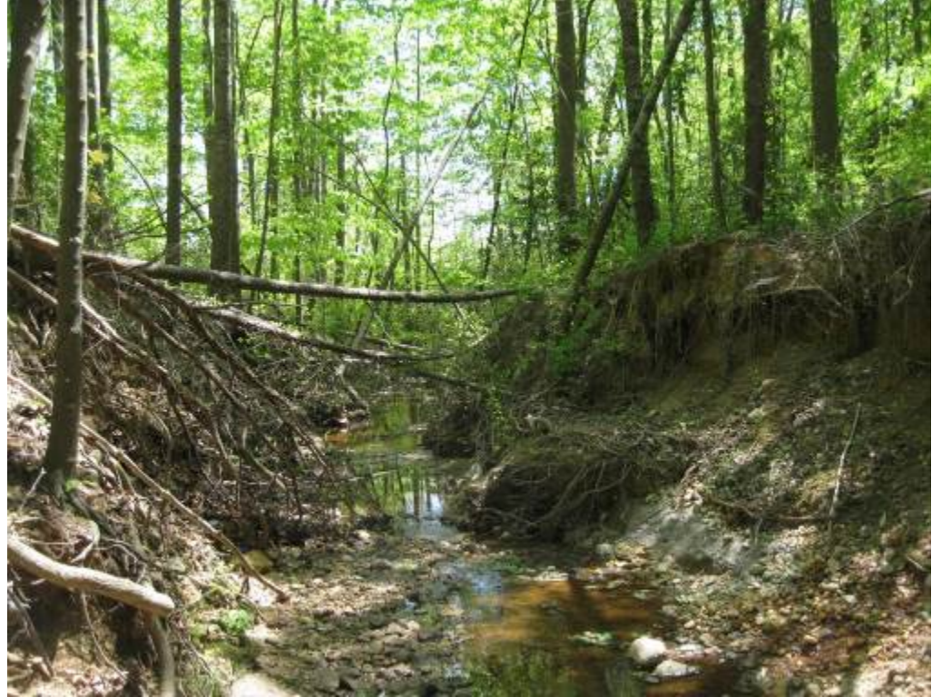
Facility 5047. Receiving channel downstream of facility is incised with vertical eroding banks.