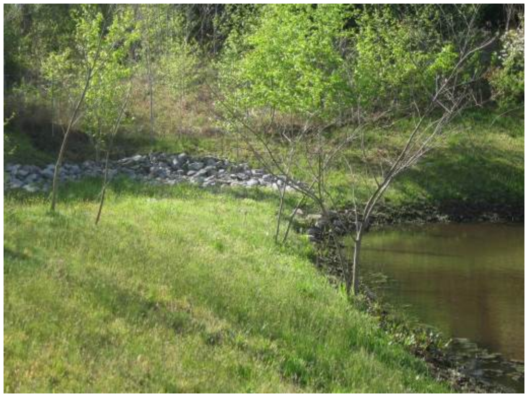
47. Facility 454. Looking at riprap along emergency spillway and small trees on dam.