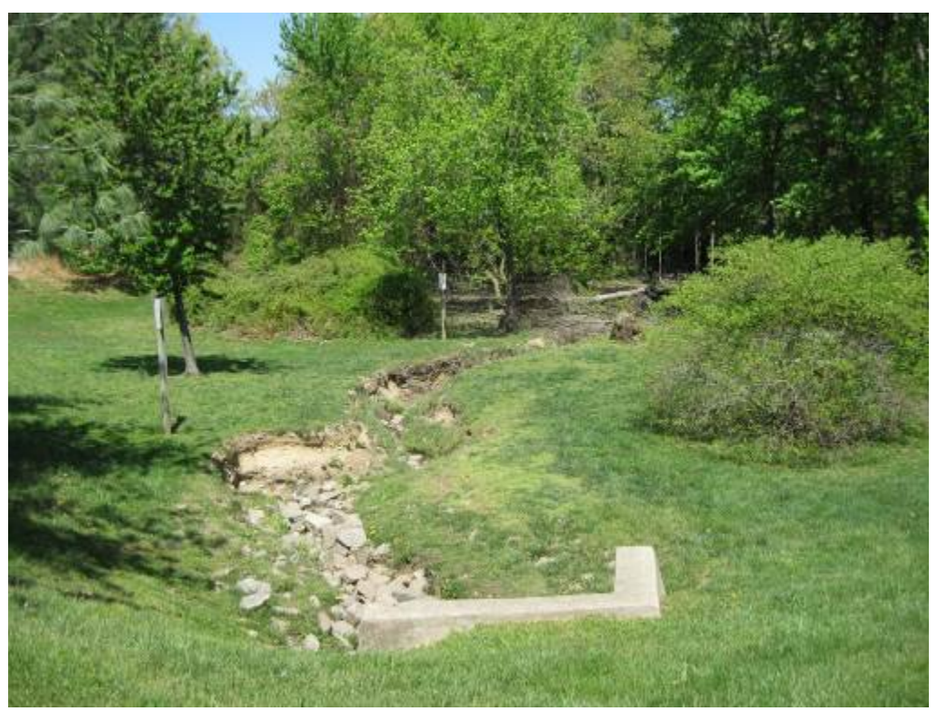
29. Facility 9026. Looking downstream at eroding channel that drains into the facility.