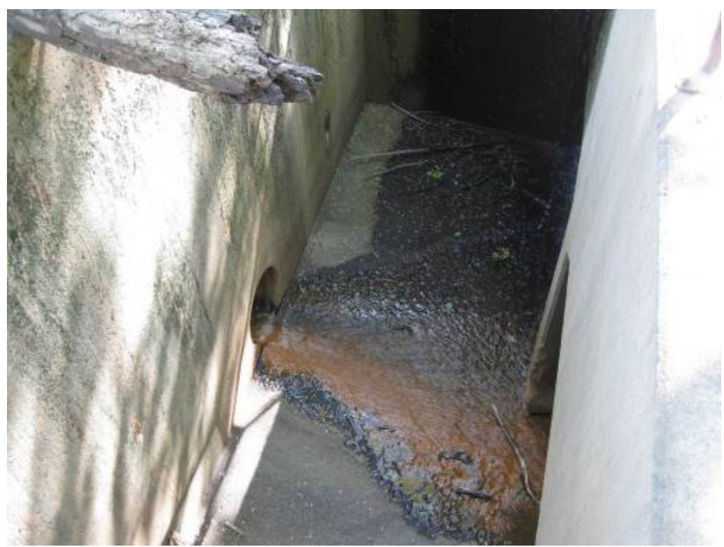
32. Facility 92. Looking at outlet which is draining to double box culvert under Interstate I-95.