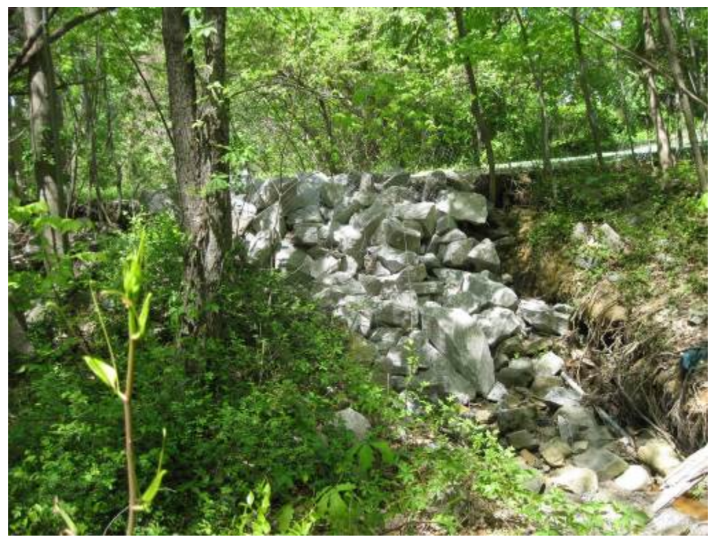
70. Facility 5707. Temporary repair of repair with riprap at dam and road failure immediately upstream of facility. Riprap is not flush with ground, and is impassable.