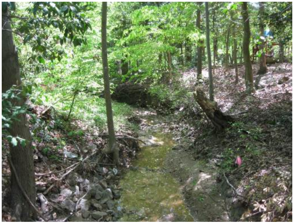
53. Facility 465. Looking downstream at incised channel showing active signs of erosion. Notice proximity of adjacent residences.