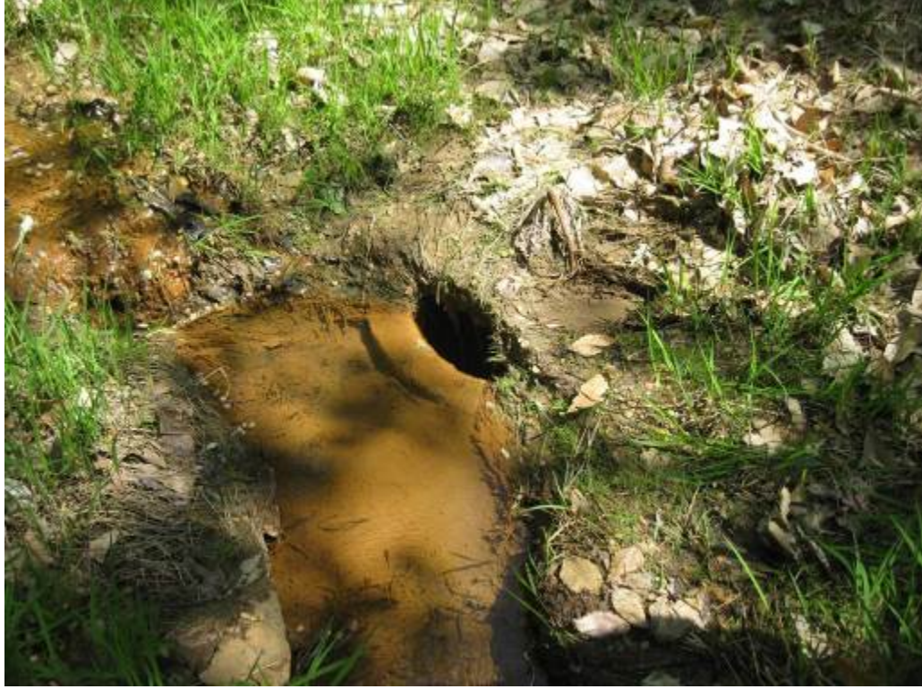
20. Facility 481. Looking at drain tile, which is partially blocked with sediment and debris.