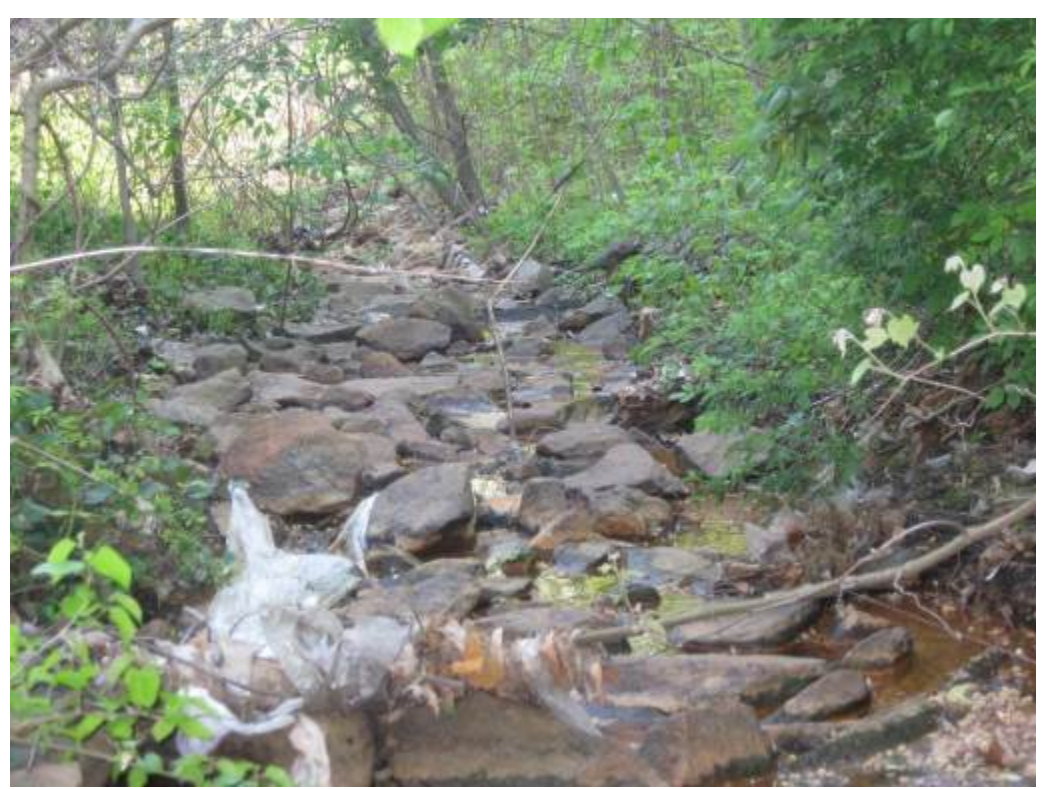
48. Facility 454. Receiving channel immediately downstream of the facility is stable with naturalized large rock.