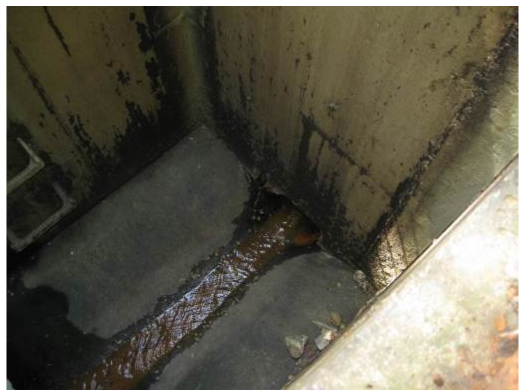
18. Facility 481. Looking in riser at low flow orifice.