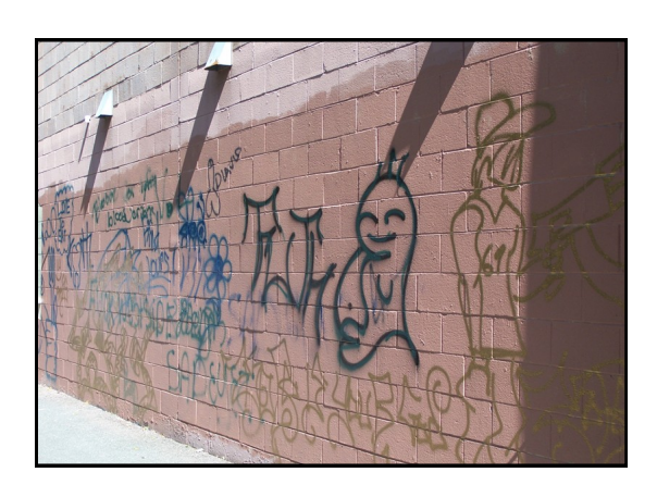
Report it and Remove it